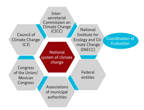
Figure 1 Institutional framework of the National System of Climate Change