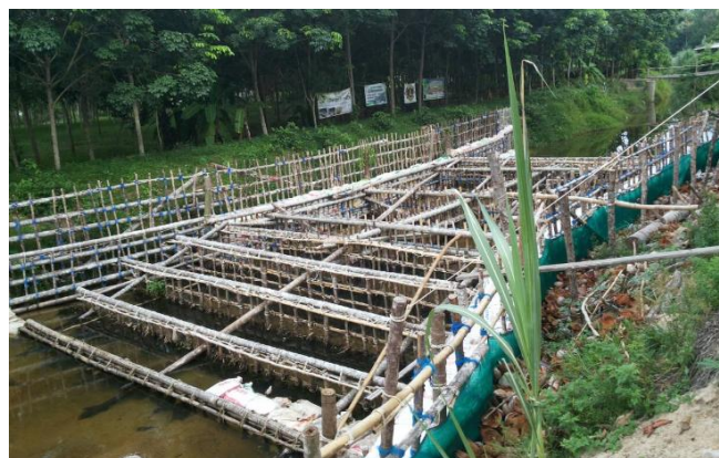
Living weir structure, Tha Di sub-river basin, Nakhon Si Thammarat, Thailand