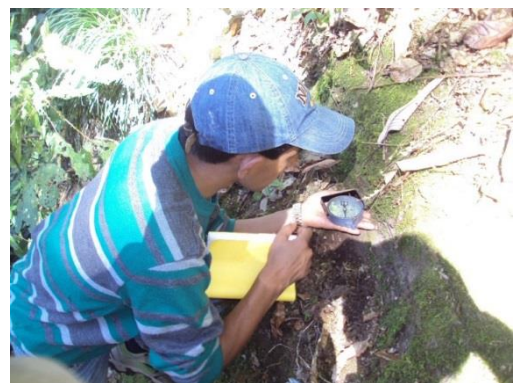
Hydrological mapping

On the basis of the results of the hydrological assessments, the national flagship programme MGNREGA (Mahatma Gandhi National rural employment guarantee act) now implements targeted springshed development in the recharge area of 72 hectares, thus ensuring optimal usage of funds available to the programme. Soil and water conservation measures at the right points have led to an improvement in spring water recharge. Local government officials have received training on scientific methods and technical skills for hydrogeological surveying and monitoring of key springs in the area. 23 springs of the area are regularly monitored in order to quantify the results of the targeted interventions.