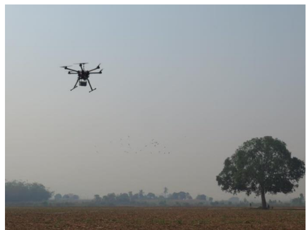
Integration of Drone into the water sector, Lum Pa Chi sub-river basin, Ratchaburi, Thailand

The monitoring concept contains traditional approaches such as hydrologic and morphological data to evaluate the effectiveness of the measures. In addition, an UAV approach contributes to demonstrating the effects of the measures. Periodically, a local university will generate data with the help of a drone.