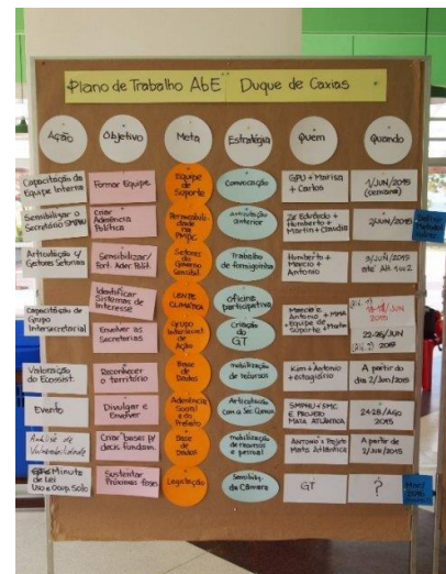
Work plan for Duque de Caxias