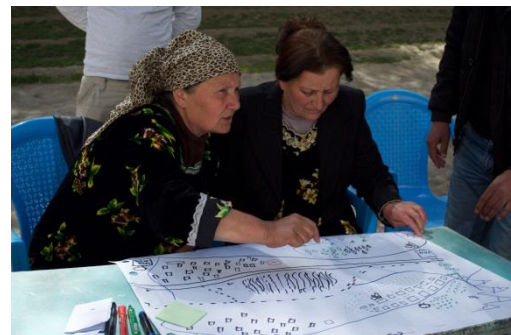
Participatory planning process

EbA should be considered as part of an overall adaptation strategy and works best when combined with other adaptation measures, which are valid for implementation since they also went through the whole selection process and are ecosystem friendly.