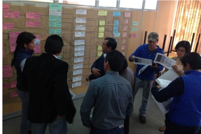
Local stakeholders in Tungurahua conducting a participatory risk and vulnerability assessment using the MARISCO method (Photo: Nadia Manasfi, GIZ Ecuador))