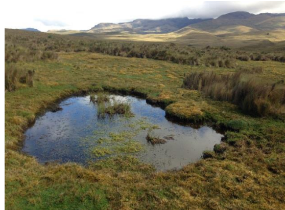
Páramo ecosystem in the province of Tungurahua depicting its hydrological richness and scenic beauty

The páramo – the typical moorland of the high Andes – is an important ecosystem in the area as it provides key ecosystem services, especially with respect to water regulation. Nevertheless, this ecosystem is under severe threats mainly due to overuse and climate change. Thus, its conservation and sustainable use are important elements of the participatory governance model being implemented in Tungurahua. With a projected reduction in annual precipitation in Tungurahua, it is ever more important to conserve the páramo ecosystem in order to ensure long-term water availability.