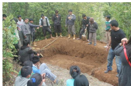
Percolation pit

The project, through partnerships with several institutions and technical experts, brings an innovative scientific approach to the identification and resolution of water management issues. It also links these new methodologies with government schemes such as MGNREGA and the National Rural Drinking Water Program for kicking off a structured implementation of water sector reforms. These endeavours have opened up people's perceptions of power over their local natural resources. It has mobilized communities to address their local governments, seeking resources to carry out interventions on their own.