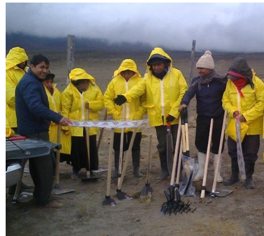
Local parish government of Pilahuín and community members set to work in their forest management association with newly acquired tools.