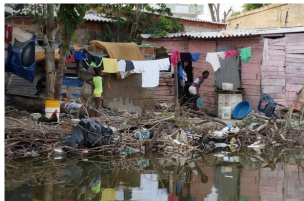
Recovery of canals and channels and mangroves – a reasonable measure.