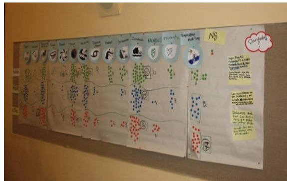
Participatory planning process

Urban mangroves have been exposed to high levels of pollution, deforestation and degradation, affecting their resilience and ability to provide quality ecosystem services to local communities in Cartagena. The GIZ's EbA Project and Ecosystem-based adaptation strategies in Colombia and Ecuador programme is implementing pilot projects for the restoration of mangroves in particularly vulnerable areas of the coastal lake of Ciénaga de la Virgen. This is the result of a planning process among approximately 40 institutions. A 4-step approach was applied during an expert workshop to identify and prioritize EbA measures: