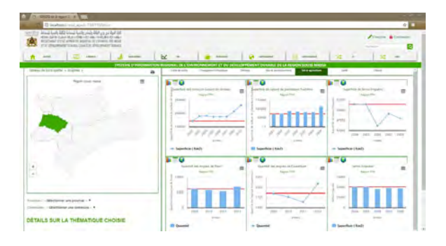
Figure 3 Example of the SIREDD-Souss-Massa interface, the module « climate change metric » - visualising the indicators in the scorecard.