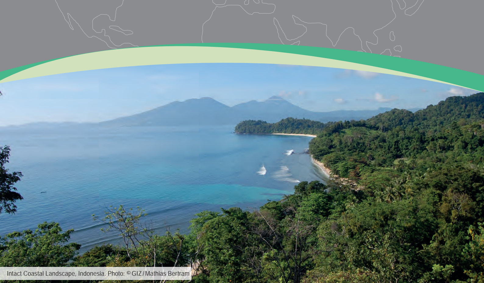
Intact Coastal Landscape, Indonesia.