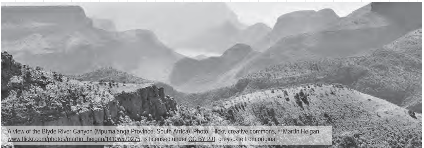
A view of the Blyde River Canyon (Mpumalanga Province, South Africa).