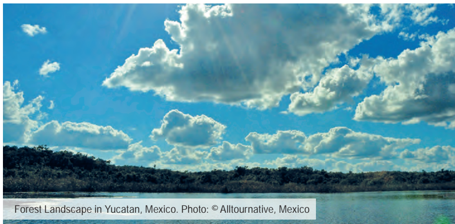
Forest Landscape in Yucatan, Mexico.

Experiences from practitioners on how to generate evidence of Ecosystem-based Adaptation (EbA) by applying field-proven methods, tools and approaches and on how to use existing evidence effectively.