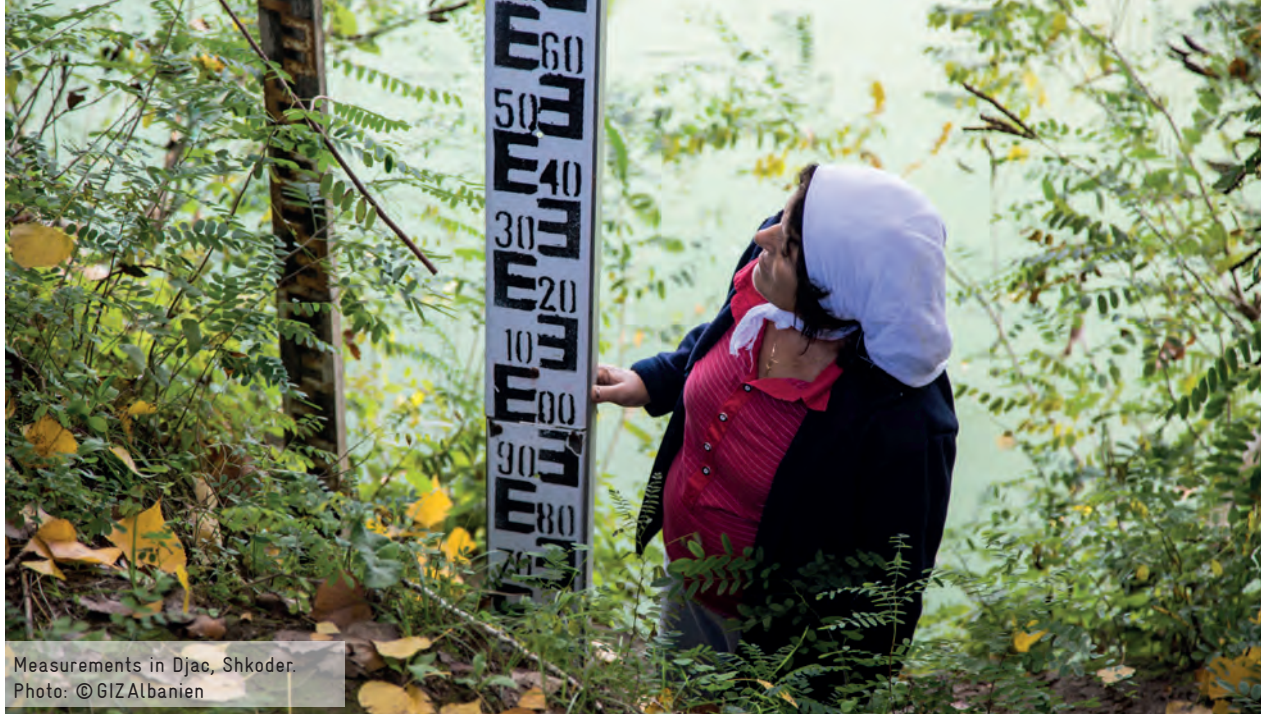
Measurements in Djac, Shkoder.

the Regional Development Fund and mainstreaming adaptation into the mid-term budget.