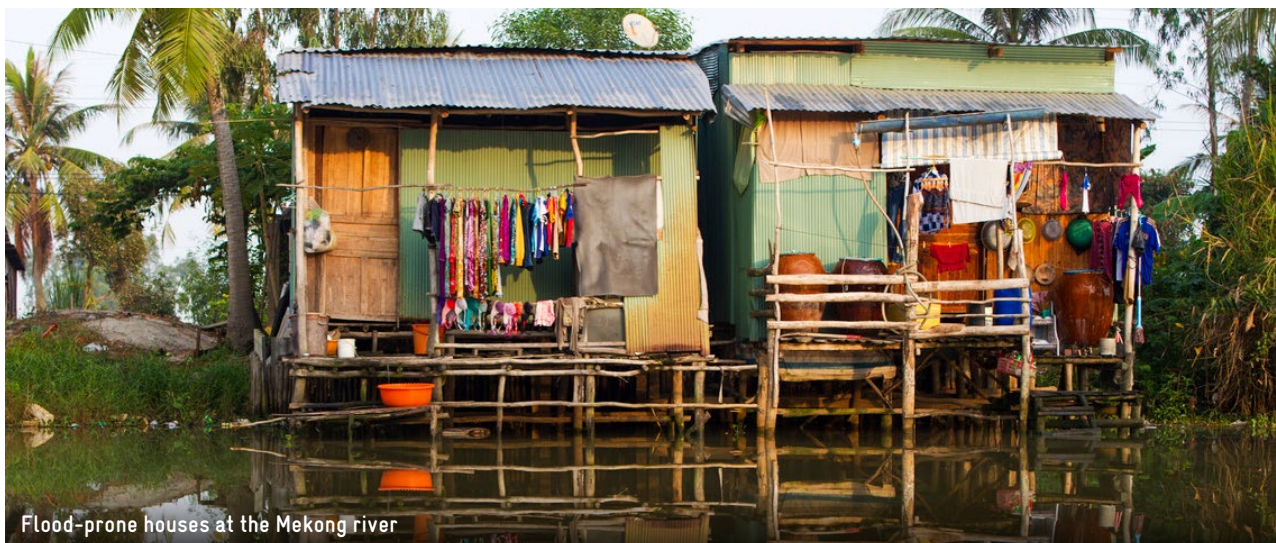
Flood-prone houses at the Mekong river

In particular, sea-level rise and its impacts were a prominent issue during the early negotiations of the UN Framework Convention on Climate Change (UNFCCC) in 1992. Nevertheless, mitigation of greenhouse gas emissions was the dominant focus in the first decade of the UNFCCC's work. This changed in the mid-2000s, driven by the growing scientific evidence for the impacts of climate change summarised in the Fourth Assessment Report of the IPCC. As a result, the topic of adaptation to climate change gained importance. With the Bali Action Plan in 2007 and the Cancún Adaptation Framework introduced at the sixteenth Conference of Parties to the UNFCCC (COP16) in 2010, the topic of Loss and Damage associated with the adverse effects of climate change entered the negotiations. A workplan on Loss and Damage was established to specifically address slow onset processes and extreme weather events.