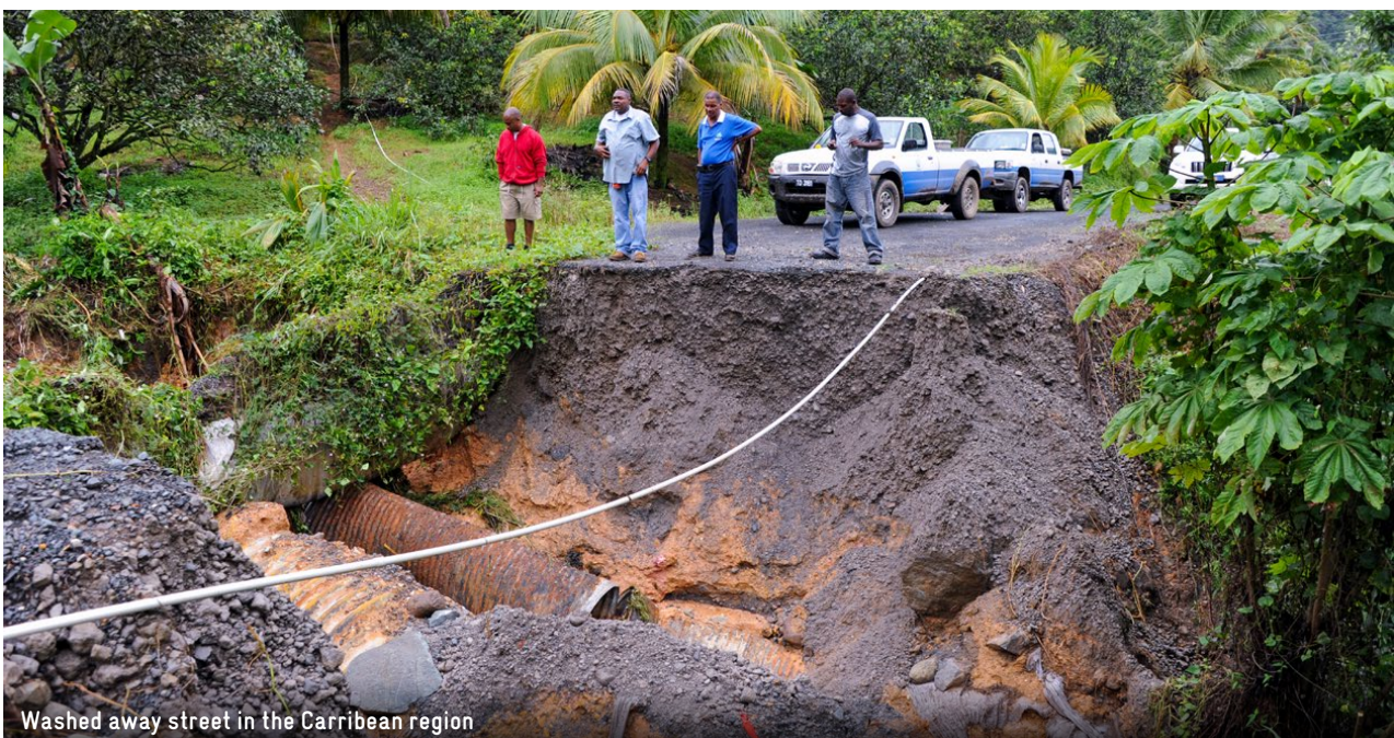
Washed away street in the Carribean region

Important steps for dealing with losses and damages from an EU perspective are a smart combination of different instruments, such as comprehensive risk analyses, capacity building, and dealing with residual risks. The latter can be covered, for example, by innovative financing instruments. This is one of the reasons why the Federal Government of Germany is promoting the InsuResilience Global Partnership , which is helping to establish a climate risk insurance mechanism at regional, national, and local levels. In addition, the German Federal Ministry for Economic Cooperation and Development (BMZ) supports a Global Programme on Risk Assessment and Management for Adaptation to Climate Change (Loss and Damage) , which aims at increasing the resilience of vulnerable countries through comprehensive (climate) risk management. In this context, the Global Programme on Human Mobility in the Context of Climate Change , which pilots development cooperation approaches to dealing with displacement, migration, and resettlement, is also being financed.