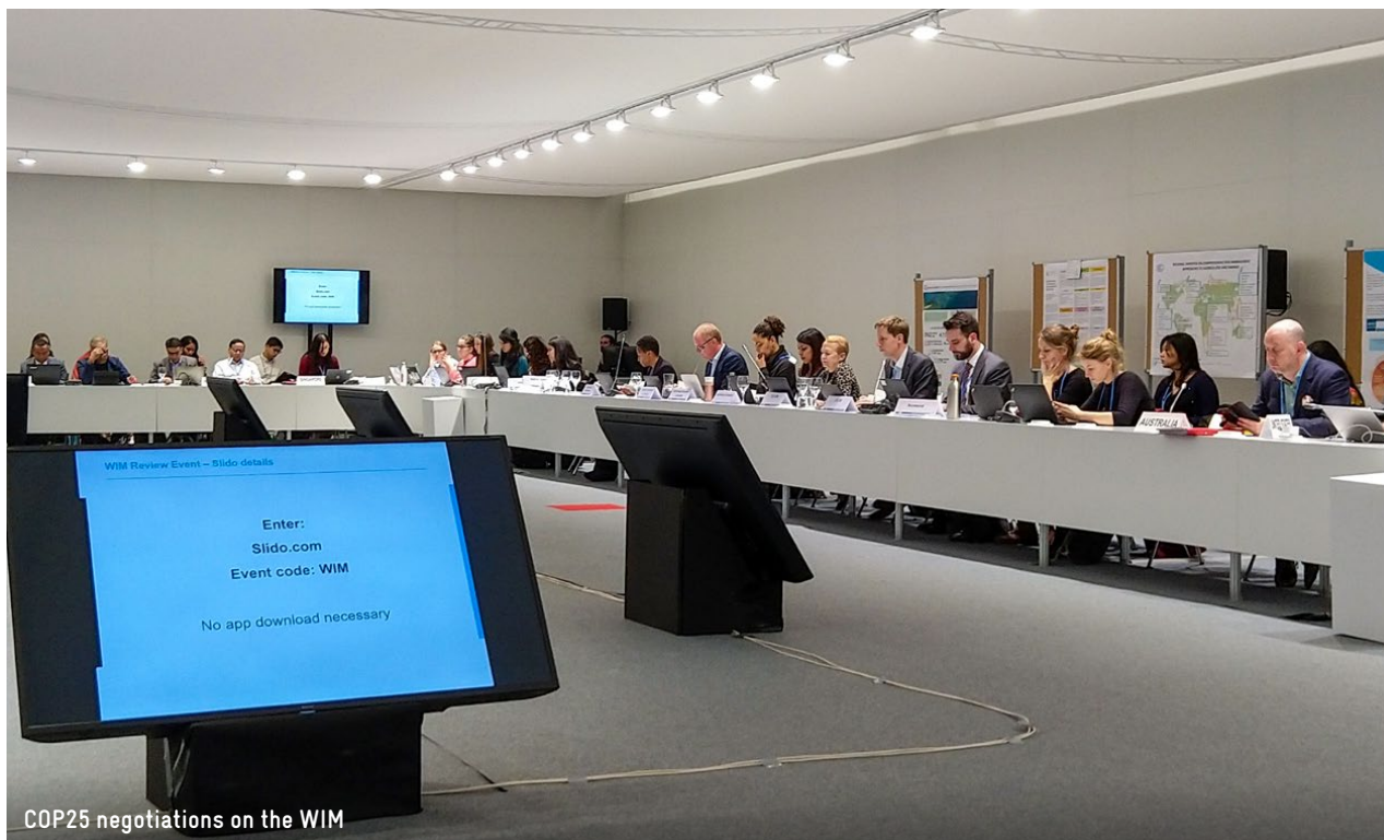
COP25 negotiations on the WIM