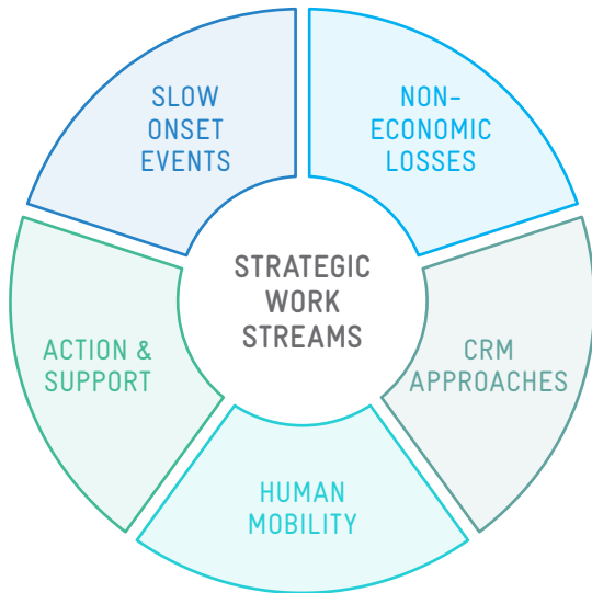
Figure 2: The five strategic workstreams of the WIM (UNFCCC, 2021).

which is of particular interest due to the political sensitivity of the topic of financing and has been implementing its action plan since mid-2021 (further details below).