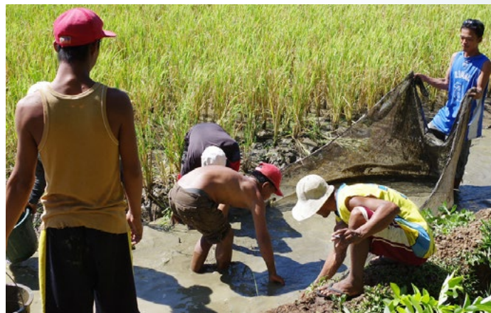
Rice fields can be made into a suitable habitat for fish and provide additional income.