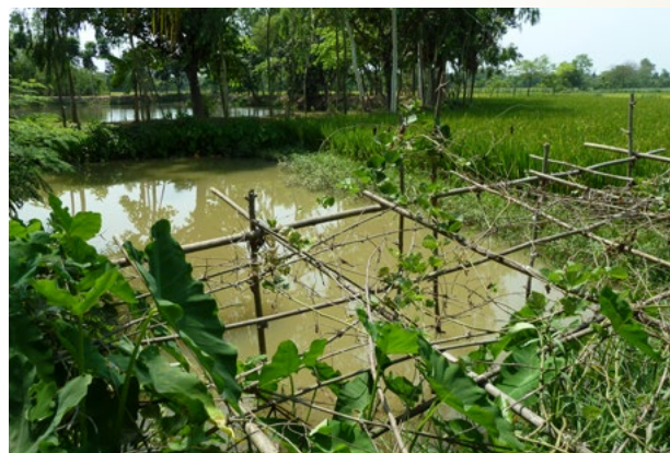
A holistic set of agroecological practices can make agriculture more resilient to climate change.

Home gardens with local varieties of vegetables support diversification and thus help households adapt to climatic shocks and ensure a well-balanced diet for local families. Organically produced vegetables (fertilized with just compost) provide income, especially for women who are traditionally responsible for home gardens. They can sell their vegetables to organic restaurants in nearby towns and share their experiences in the newly established Women's Clubs.